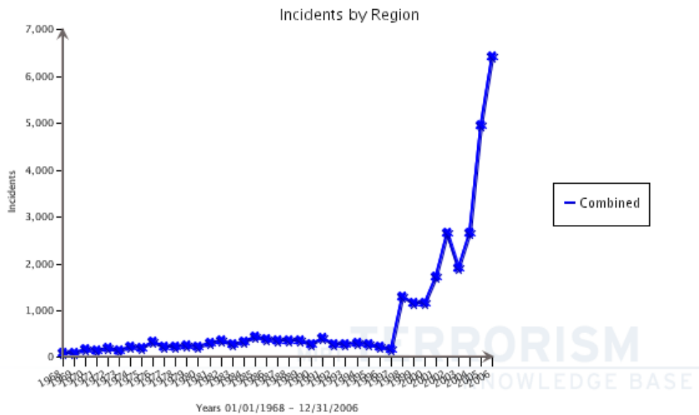
Figure 1: Yearly total number of terrorism-related incidents in the world, 1968-2006

Source: MIPT – Terrorism Knowledge Base ( www.tkb.org )